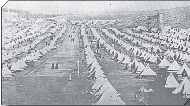
Concentration camp during the Anglo-Boer War

Imperialism, on the grand-scale of the Western powers, or on the scale of rising powers like China or Russia, or even of small regional powers like South Africa, does not benefit the majority of their own people. It also, obviously, does not benefit the interests of the ordinary people subjected to imperialism – although local ruling classes often find ways to accommodate to the system. This means that the struggle against imperialism is not a battle between unified nations or regions, like the 'North' or the 'South', but a fight to be led by the popular classes, worldwide, against ruling elites, worldwide.