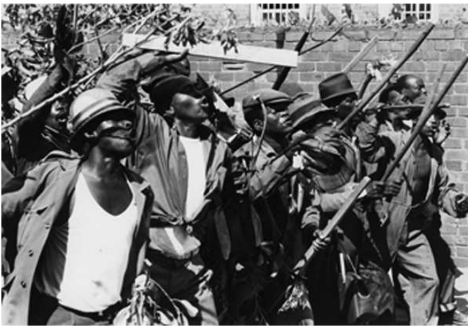
Municipal workers' march, 1973